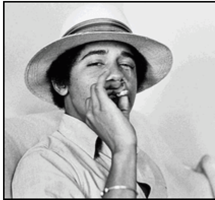
Future president of the Harvard Law Review

The media made this dubious accomplishment into the single most shining centerpiece of Obama's otherwise lackluster college career that got him into Harvard in spite of it.